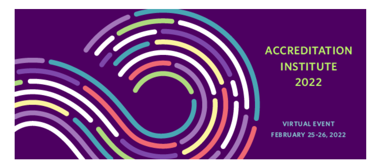
Register for the 2022 Accreditation Institute - Virtual Event